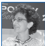
HSR Impact Winners Announced p. 6