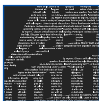
National Health Policy Conference p. 3